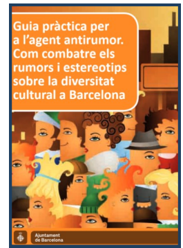
A pamphlet from Barcelona's anti-rumor campaign

See: citiesofmigration.ca/good_idea/the-dilemma-workshop/